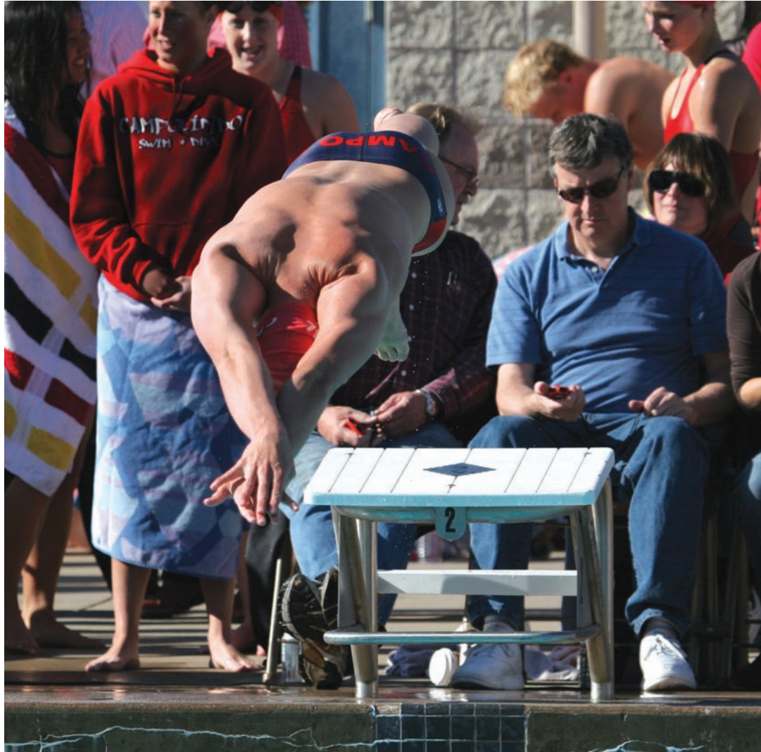
Campolindo Cougar perfectly airborne before breaking the water