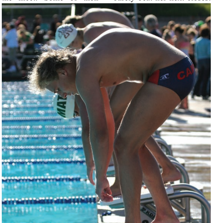
Swimmers take their mark