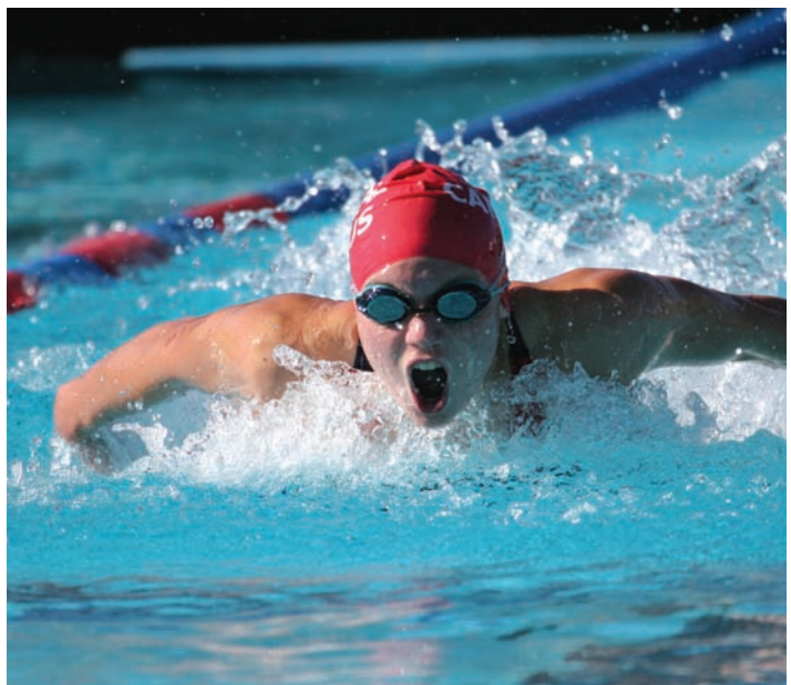
Campolindo girls shows intensity in the butterfly stroke