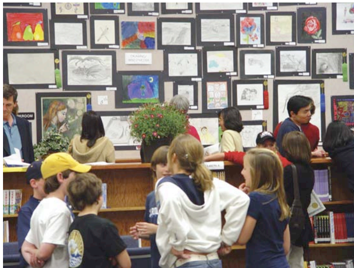
Families were able to view all of the contest entries in the JM library after the event