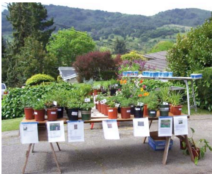
Plants in abundance at last year's sale!

For more information on the Bret C. Harte Internship and its other fundraising events visit www.bretchartefund.org