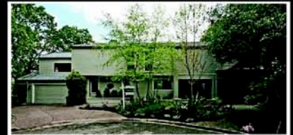
3320 Woodview Ct. Lafayette OPEN SUNDAY 4 Bedrooms, 3 Baths—Large Lot with views