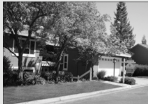
943 AUGUSTA DRIVE MORAGA