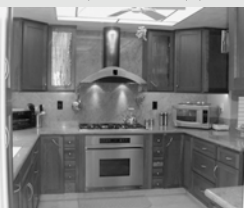
1918 HIGHRIDGE CT. WALNUT CREEK