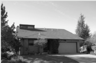
55 SAINT THOMAS LANE PLEASANT HILL