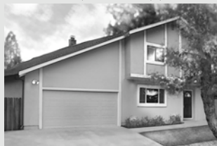
2724 BUENA VISTA AVE WALNUT CREEK