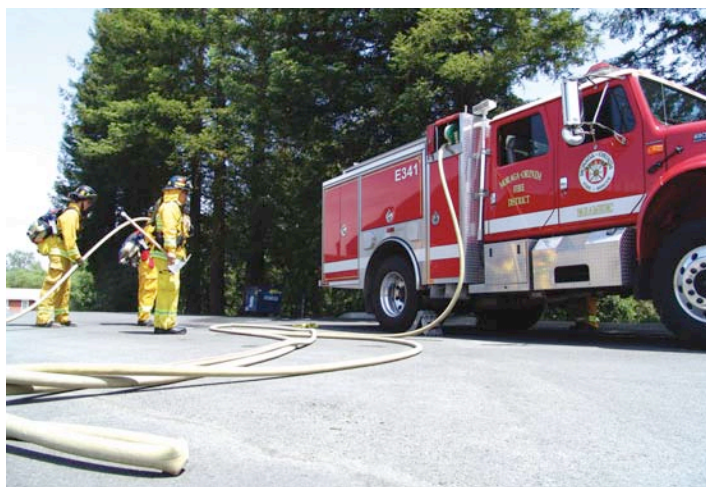
Moraga-Orinda firefighters drill regularly