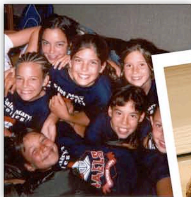
2007 is the 38th year of sports camp excellence at SMC