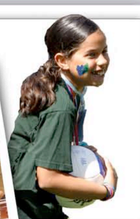
Amazing coaching, housing & food