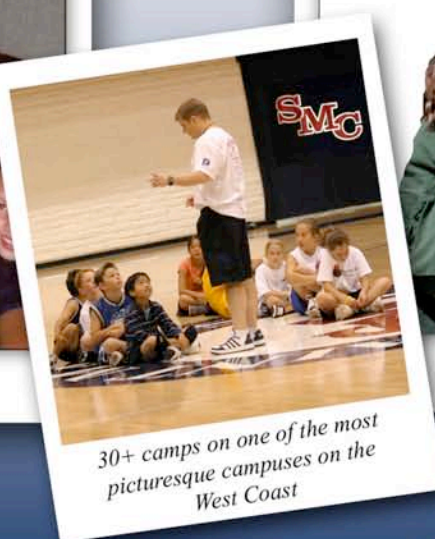
30+ camps on one of the most picturesque campuses on the West Coast