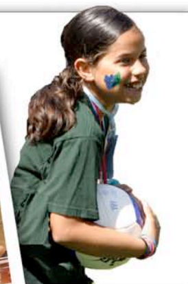
Amazing coaching, housing & food