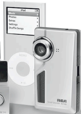
RCA Small Wonder™ Camcorder