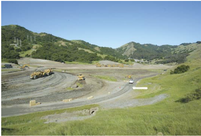
Orindas newest housing development - Wilder