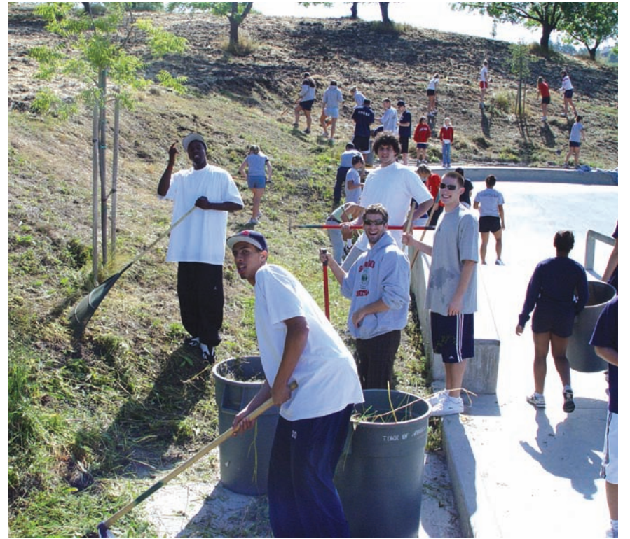
St. Mary's athletes dig in