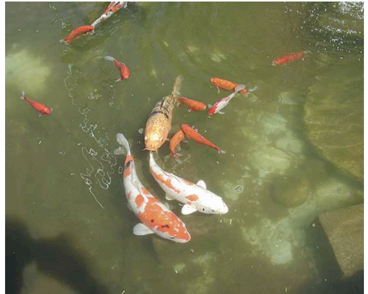
Koi swim happily in the pond

"Are You Raising Mosquitoes in Your Backyard?"