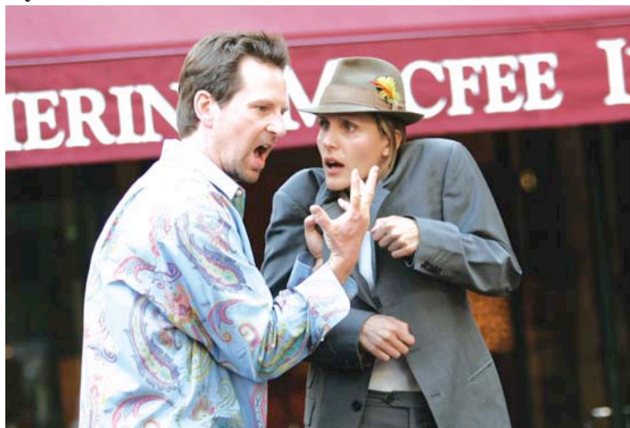
Cal Shakes actors perform at Theater Square