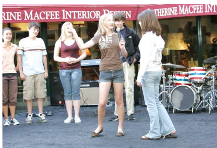
OIS students delight the crowd