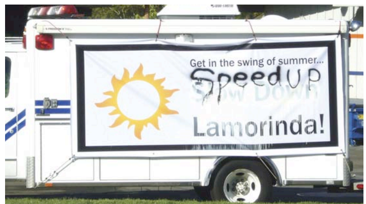
The vandalized Slow Down banner