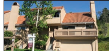
275 Paseo Bernal, Moraga $785,000 End-unit Light + Bright Open Sun. 1-4