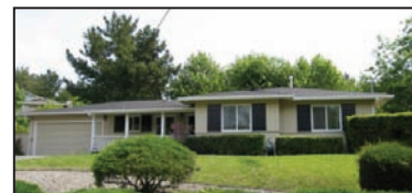
30 Ramona Drive, Orinda $875,000 Darling 3Br/2Ba First Open Sun. 1-4