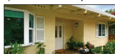
121 Cypress Pt. Way, Moraga $779,000 MCC Single Lvl 2Br+Den Open Sun. 1-4