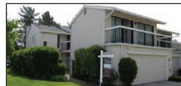
653 Augusta Drive, Moraga $885,000 Spacious 4Br/2.5Ba First Open Sun. 1-4