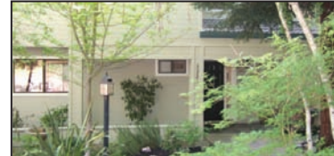
3320 Woodview Ct, Lafayette $1,395,000 Gorgeous Updates 4+Br Open Sun. 1-4