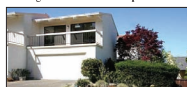
10 Berkshire Drive, Moraga $849,000 Updated 3Br/3.5Ba First Open Sun. 1-4