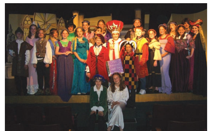
Cast of Once Upon a Mattress, Spring 2007