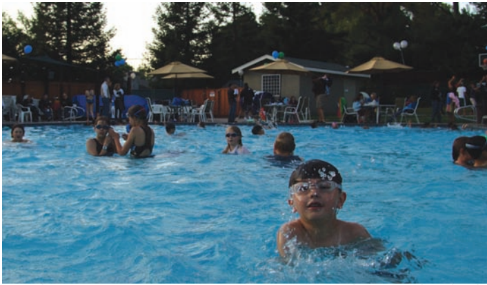
Grand Opening Party, May 25