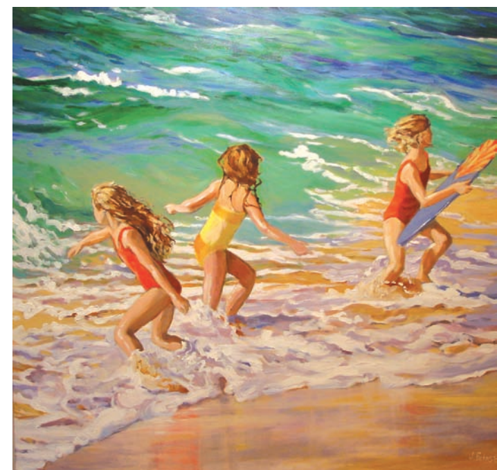
Three Girls in the Surf, Kauai by Judy Feins

The artists at the Lafayette Gallery are celebrating the imminent arrival of summer with their new exhibit entitled, Some Like It Hot. Using the heat of the season as inspiration, the artists have created art that reflects the contrasts of summer in Lamorinda from the white heat of the noon sun and yellow-brown grass on the hills to the cool, blue water of the pools and blue-green foliage of the pine trees. One of the best ways to experience the exhibit is to start with a stroll through the sculpture garden situated behind the gallery, stop to rest (and maybe share an ice cream cone) on the bench outside the entrance, then find refuge from the heat in the air-conditioned environs of the gallery and enjoy the original artworks in the exhibit.