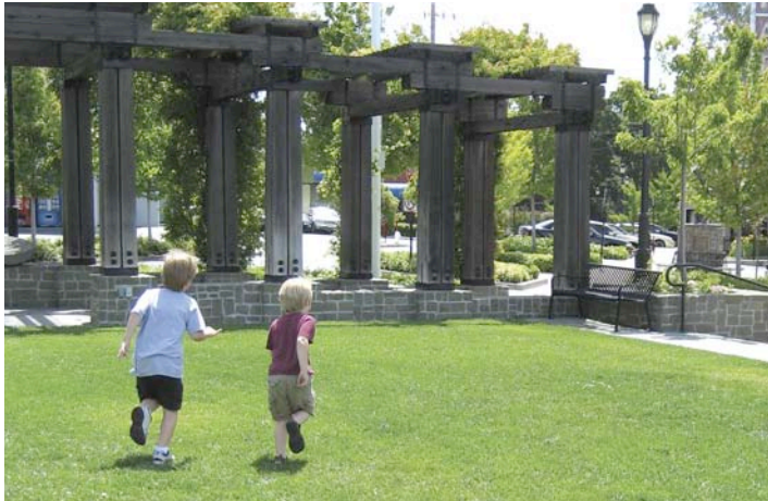
Jefferson, 6, and Jonny, 4, race to find the 'treasure' hidden at the corner of Lafayette park.

If you see people in Lamorinda wandering aimlessly in parks, digging through foliage on hiking trails, or perhaps on hands and knees under a park bench or near a lamp post, they may be on a new type of adventure: geocaching.