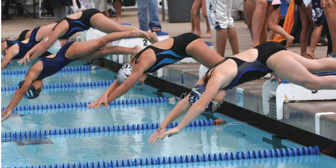
Swimmers kick off meet at Acalanes