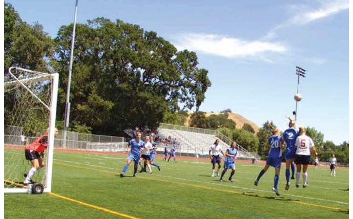
Long-time women's amateur soccer league takes on Sonoma County Sol at Acalanes