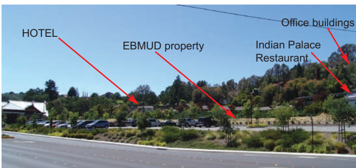
The Woodbury development area from Risa Road to the Indian Palace Restaurant today