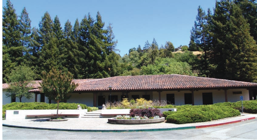
The Moraga Library at 1500 St. Mary's Road

At the June 13th Town Council meeting, the Friends of the Moraga Library presented a request for $18,000 to take care of the most immediate maintenance issues. By the end of the meeting, it was decided that these repairs would be included in the Capital Improvement budget that will be discussed at the Town Council meeting on June 27th. The estimated costs for replacing the Library's heating and air conditioning system and repairing the roof are $229,500 (Source: "Capital Improvement Programs" budget presented to the Town's "Audit and Finance Committee" on May 29, 2007, p. 37).