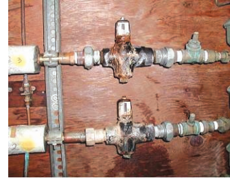
Two valves of the HVAC system similar to the one that failed in April 2007

The asset replacement fund is not yet available to