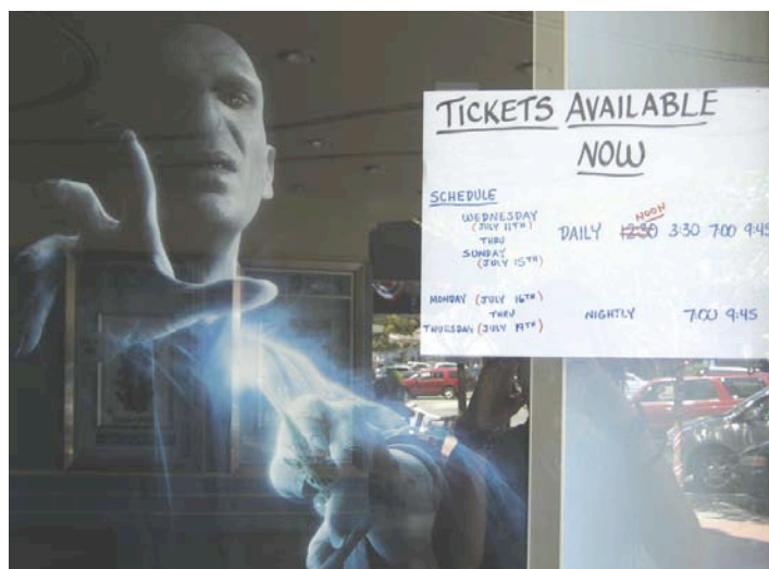
Harry's coming to the Orinda Theater

-The Harry Potter series has been translated into over 63 languages other than English, and there are different versions for the U.S. and the U.K.