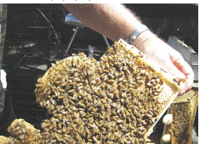
A closeup of one of Gentry's hives