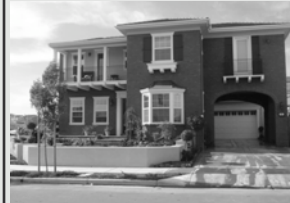
301 MONTE ALBERS DRIVE DANVILLE