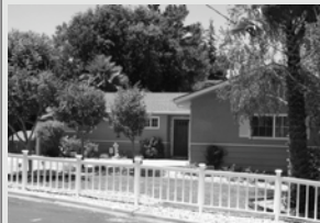
1241 S. ROSAL CONCORD