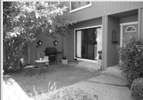
756 COUNTRY CLUB DRIVE MORAGA