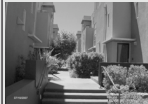
28 LOOP 22 (POWELL & DOYLE) EMERYVILLE