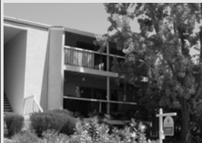
1973 ASCOT DRIVE #B MORAGA