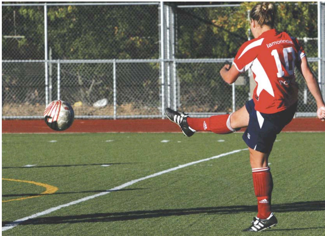
10 Sarah Churchill