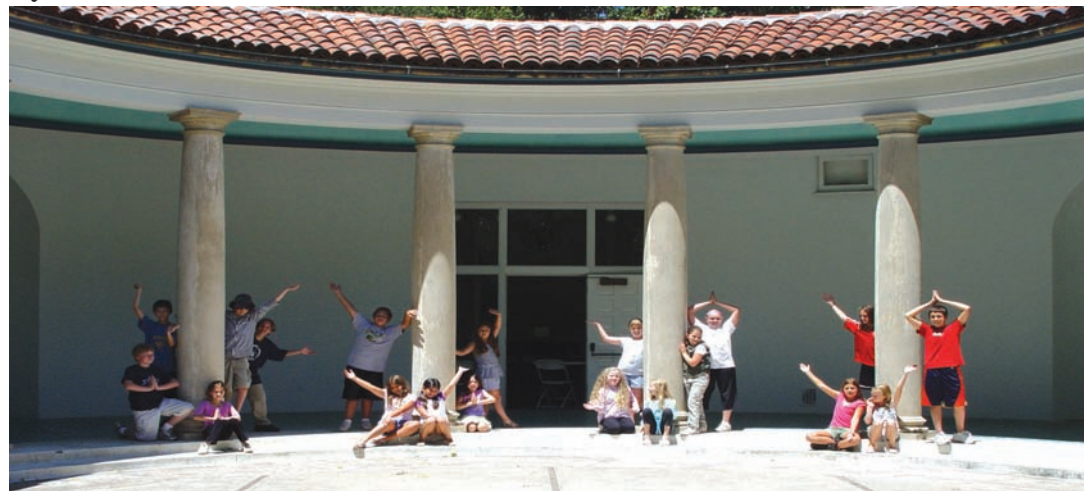
The cast of Aladdin, Jr on the Hacienda stage