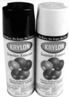
Auto ship on black and white only

P513 770, 739 B6 While supplies last. Local Restrictions may apply.