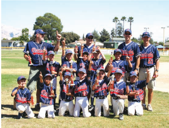
Team members and coaches with their trophies

The OBA Titans won all six of their games at the FNYB 4th of July Tournament, four by lopsided scores, to bring home the 8 & Under title. The championship game was very exciting and tightly contested. The Fremont Cal Ripken team took an 8-7 lead with a grand slam in the top of the fifth. The Titans responded with six straight hits to open the bottom of the fifth, however, and ended up scoring six huge runs in that decisive frame en route to a thrilling 13-11 victory.