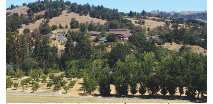
Sanctuary and Temple Isaiah Classroom Building from Reservoir Parking Lot

The Planning Commission heard an initial proposal last week from the Contra Costa Jewish Day School, a K-8 parochial school, which is requesting a land use permit and development permit to expand its existing facility at 3800 Mt. Diablo Blvd.