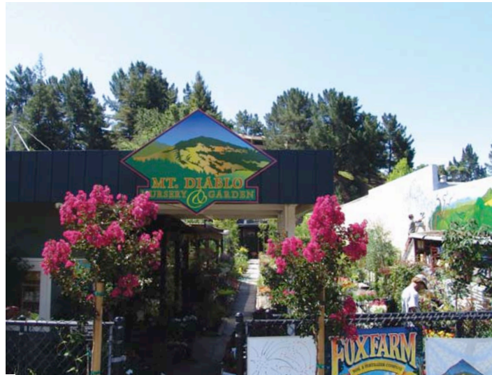
Mt. Diablo Nursery & Garden, 3295 Mt. Diablo Blvd. Lafayette