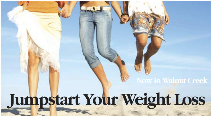
Now in Walnut Creek

Read our previous article about Xenophon on-line at: http://www.lamorindaweekly.com/archive/issue0109/pdf/HORSESWITHHEARTORINDASGENTLEHEROES.pdf