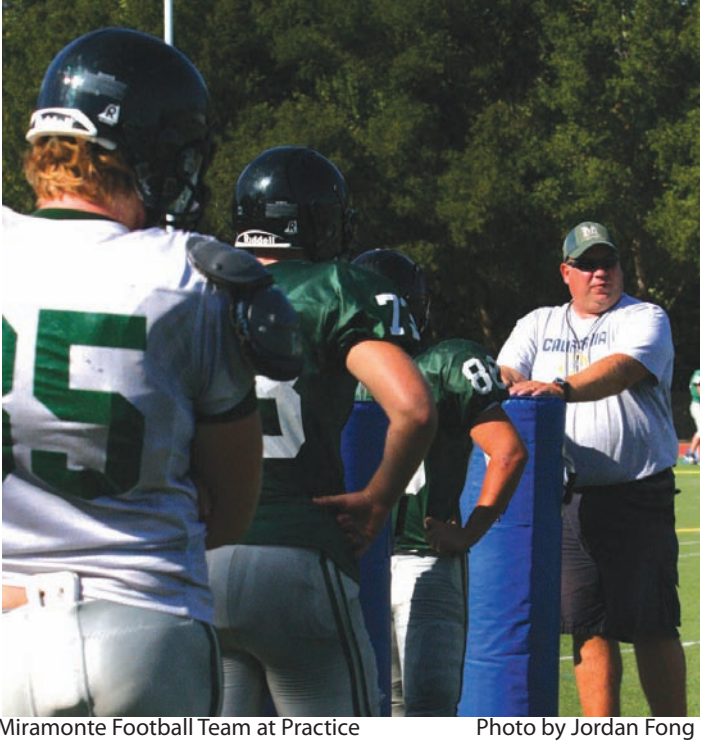
Miramonte Football Team at Practice