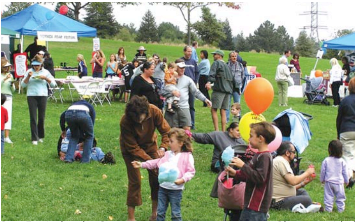
Pear Festival at the Commons 2006