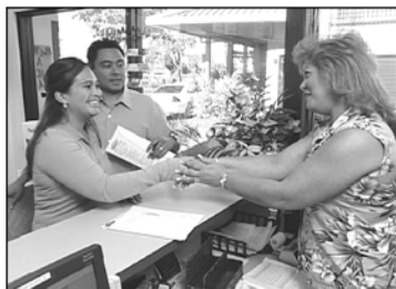
OVER 30 DIFFERENT SIZES, WITH A PRICE FOR EVERY BUDGET!

NOW you can rent or make payments 3 ways FAST...use 5A's convenient new ARM paystations, pay at the gate, or on-line www.5Aspace.com