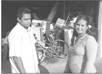
GOT A GARAGE OR SPARE ROOM THAT LOOKS LIKE THIS? YOU NEED STORAGE!