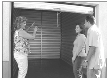
5A CAN SHOW YOU HOW TO GET MORE SPACE AT HOME OR WORK

NOW you can rent or make payments 3 ways FAST...use 5A's convenient new ARM paystations, pay at the gate, or on-line www.5Aspace.com