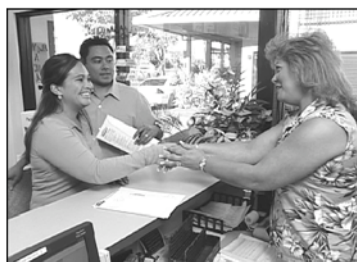
OVER 30 DIFFERENT SIZES, WITH A PRICE FOR EVERY BUDGET!