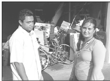
GOT A GARAGE OR SPARE ROOM THAT LOOKS LIKE THIS? YOU NEED STORAGE!