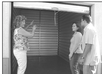
5A CAN SHOW YOU HOW TO GET MORE SPACE AT HOME OR WORK