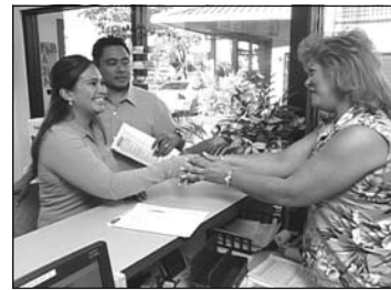
OVER 30 DIFFERENT SIZES, WITH A PRICE FOR EVERY BUDGET!

* Special "One Month Free" is for new rentals only, based on specific units and may be limited. Call for details. Expires 9/30/07