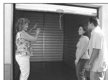
5A CAN SHOW YOU HOW TO GET MORE SPACE AT HOME OR WORK