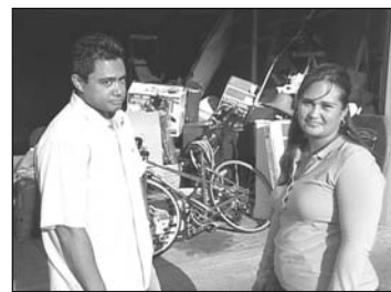
GOT A GARAGE OR SPARE ROOM THAT LOOKS LIKE THIS? YOU NEED STORAGE!

NOW you can rent or make payments 3 ways FAST...use 5A's convenient new ARM paystations, pay at the gate, or on-line www.5Aspace.com