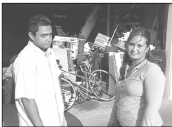
GOT A GARAGE OR SPARE ROOM THAT LOOKS LIKE THIS? YOU NEED STORAGE!