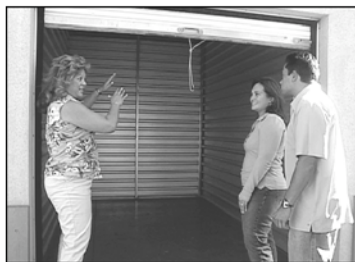
5A CAN SHOW YOU HOW TO GET MORE SPACE AT HOME OR WORK

NOW you can rent or make payments 3 ways FAST...use 5A's convenient new ARM paystations, pay at the gate, or on-line www.5Aspace.com