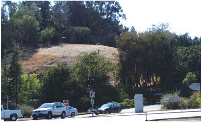
View of the site for the proposed "Lafayette Park Terrace" from Pleasant Hill Rd