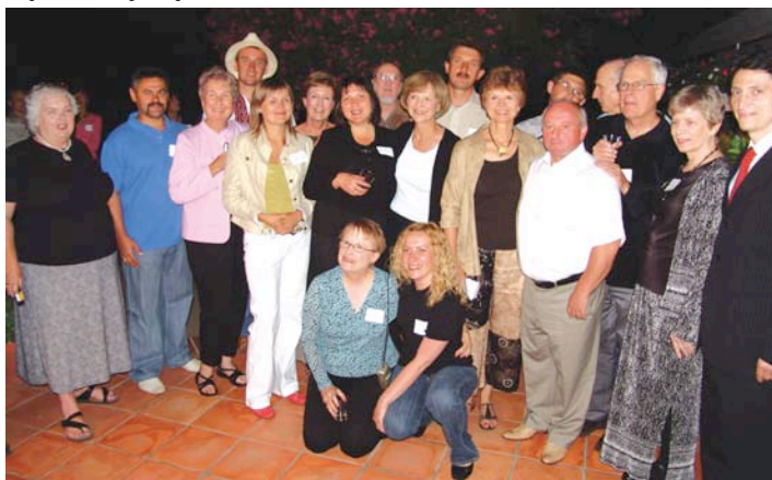
The Ukrainian delegates and their Moraga host families