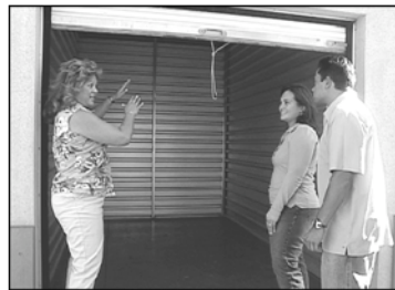
5A CAN SHOW YOU HOW TO GET MORE SPACE AT HOME OR WORK