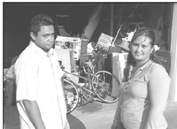
GOT A GARAGE OR SPARE ROOM THAT LOOKS LIKE THIS? YOU NEED STORAGE!