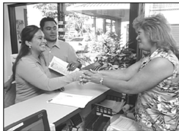
OVER 30 DIFFERENT SIZES, WITH A PRICE FOR EVERY BUDGET!