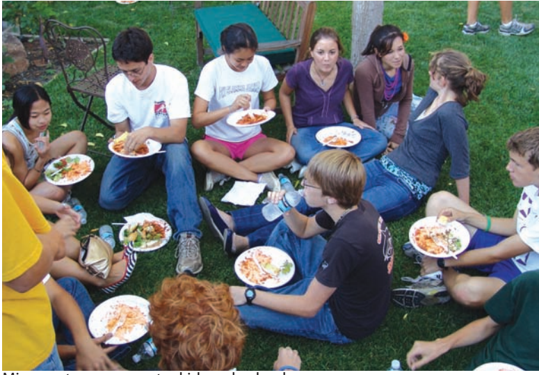
Miramonte cross country kids carbo-load