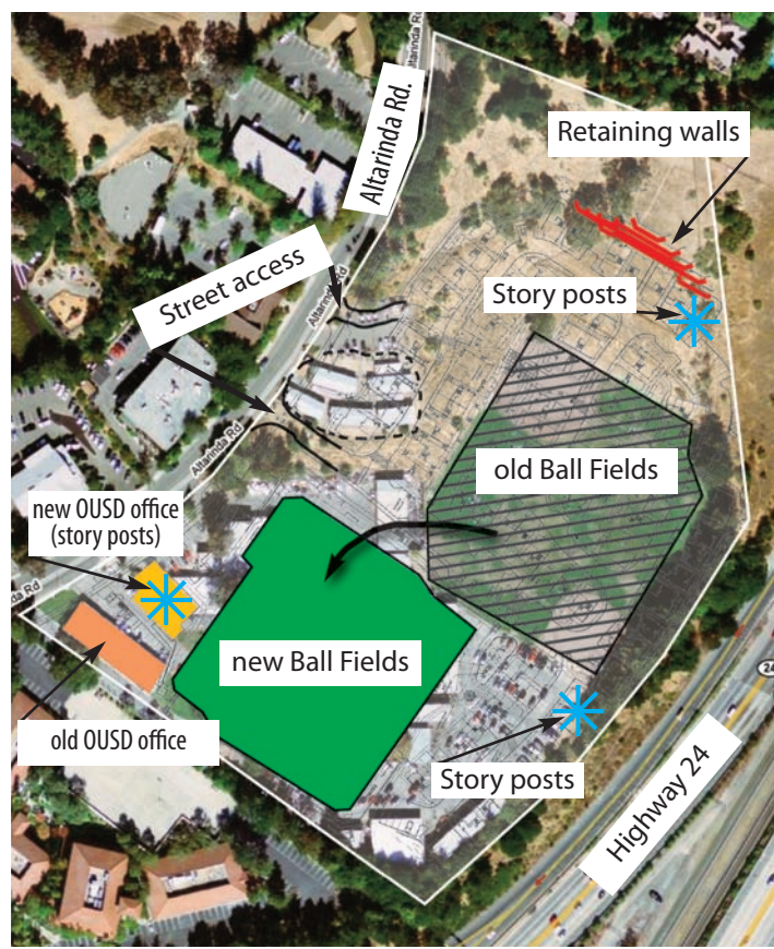
The map above illustrates the site; the old and new location of the ball park, OUSD office, new retaining walls and also the position of the new access roads Graphic Andy Scheck

In December 2003, JFK University at 8 Altarinda Rd. closed its doors and about 1,400 students left empty classrooms. Three months ago the City of Orinda moved out of trailers and into its new building at 22 Orinda Way, leaving an empty site behind. Only the nearby ball park is still in use by a variety of softball, baseball, soccer and other teams several times per week, but the field is no longer in prime condition.