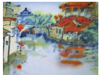
"Watertown" by Margaret Lucas-Hill

"My paintings are about light and color. I like painting natural objects and landscapes, giving them strong, vibrant colors. I am particularly intrigued by the mystical quality conveyed through light. It moves across the temperature spectrum, from icy cold to blazing hot, changing the appearance of the things it touches. Like a good novel, my paintings can have many meanings. My hope is for my images to be emotionally and spiritually uplifting. Creating art and viewing it are both part of the continuous learning process of life."