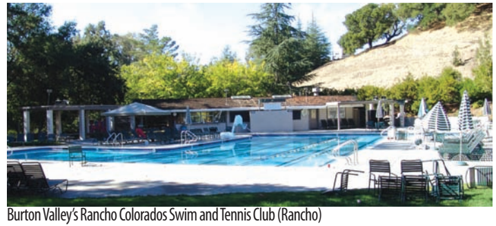
Burton Valley's Rancho Colorados Swim and Tennis Club (Rancho)