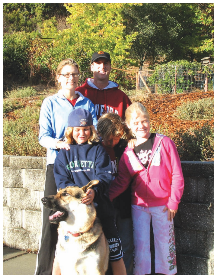
This Glorietta family invited their dog to join in the fun