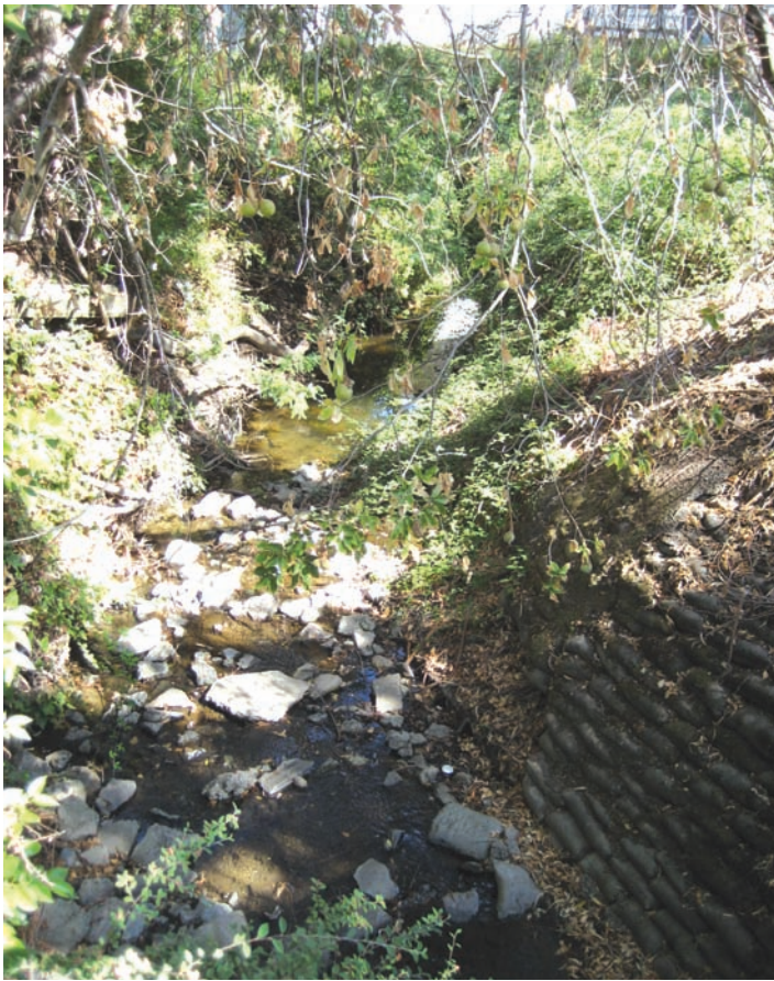
Creeks like this one behind Chow in Lafayette, meander through much of Lamorinda and feed directly into the Delta and the Bay