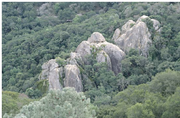
Rock City, Mount Diablo

To see more of her work, go to www.susanreynoldsphotography.com .