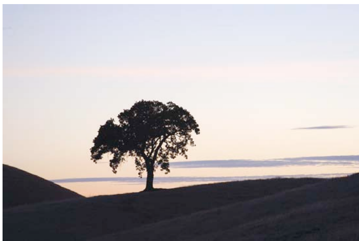
Valley Oak & Horizontal Clouds Shell Ridge