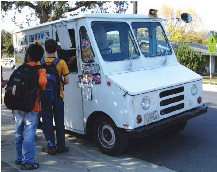
The ice cream man on School Street in Lafayette

The ice cream truck industry has changed quite a bit since my day. When we heard the tinny rendition of...what was that song? We ran into the house, begged for a few quarters and the chase was on for blocks. I balanced one sister on the back of my banana seat and another on the handlebars... 'look Ma no helmets! I braved busy streets and honking horns. I fought for my cream. The ice cream man? Well his job was rough too. He would drive fast then slow masterfully playing his funky tunes. He worked 'til dusk- he worked hard for the money.