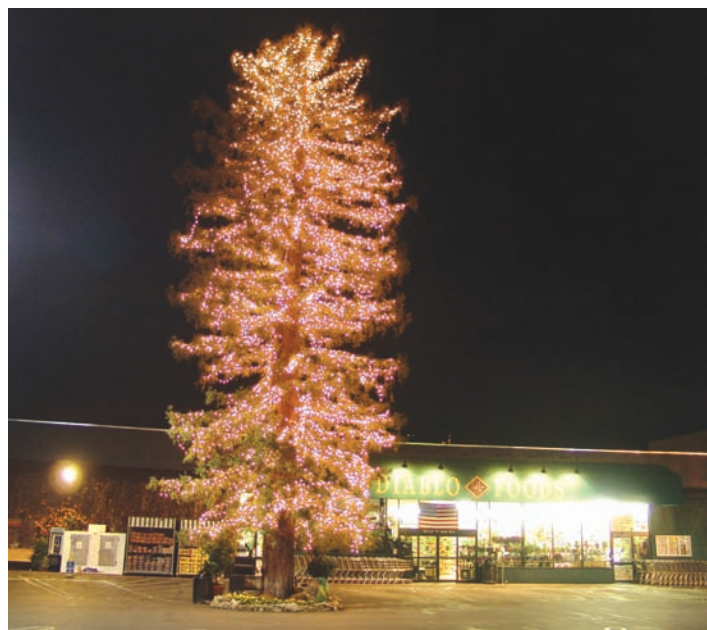
Last year's Diablo Foods' tree stands in for lack of twinkle light photo